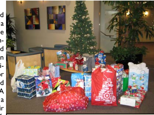
Washington Mutual's "Giving Tree"

CASA would like to give a big "thank you" to the employees of Washington Mutual Card Services in Pleasanton for making the holidays much brighter for CASA children and youth. Each CASA was asked to submit a "wishlist" of their CASA child's gift wishes. Those wish-