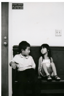
Children waiting patiently for their court hearing. Volunteers who familiarize themselves with current foster care legislation can help to improve foster youth outcomes and ensure appropriate recommendations are made on behalf of their assigned child.