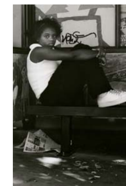
Connecting youth with valuable resources is instrumental in helping them learn to create healthy relationships and gain valuable skills.

Eastmont Branch of Oakland Public Library: This library has launched a new Teen Homework Center offering free tutoring in math, science, English and Spanish for eight hours per week. Middle and high school students can now drop-in for homework help on Saturdays from 1 to 5pm, and on Mondays from 3 to 7pm. Location: Eastmont Town Center, 7200 Bancroft, Ste 211, Oakland, CA 94605.